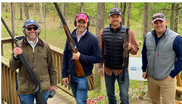
Pictured: Chattanooga Allergy Clinic Team.