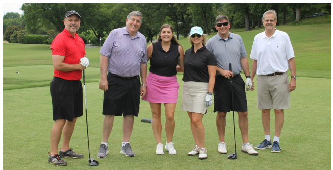
Pictured: Regions Bank Team.