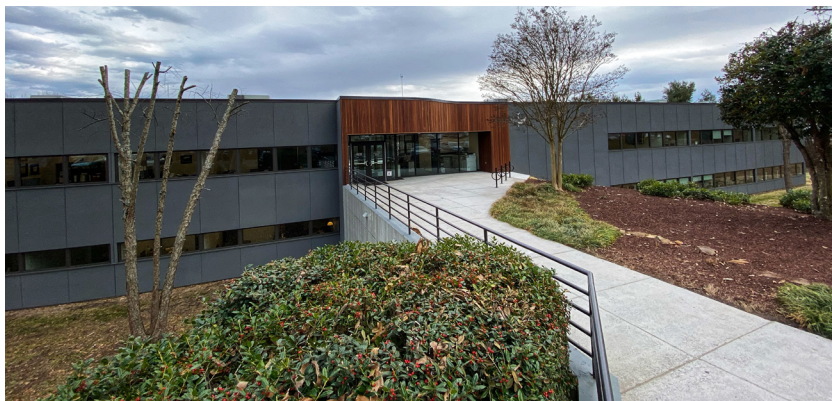
200 Tech Center Drive, Knoxville, TN 37912.