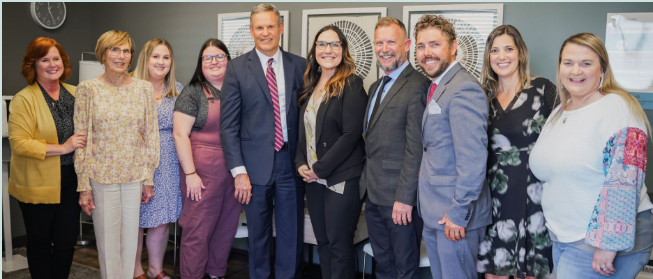
Following his tour, Governor Bill Lee met with McNabb Center's McMinn County staff.