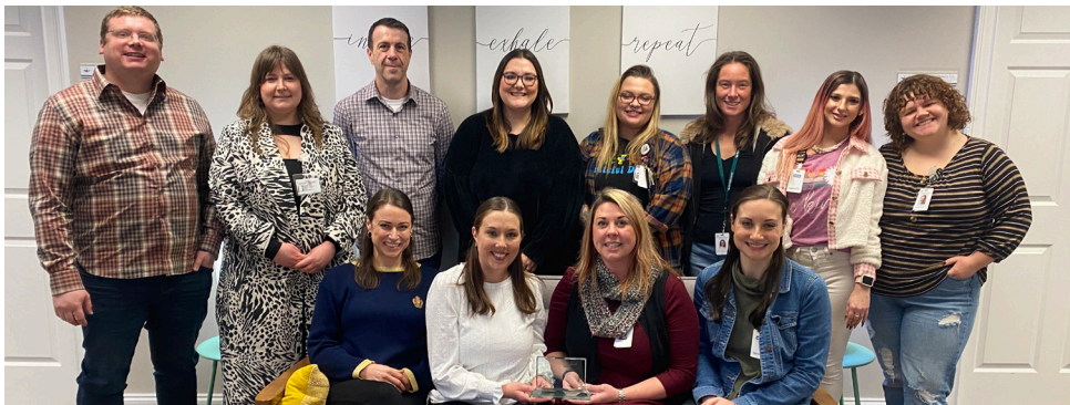
Childrens Crisis Continuum Staff

The McNabb Center was proud to accept several awards at the Tennessee Association of Mental Health Organizations (TAMHO) annual conference in December, 2022