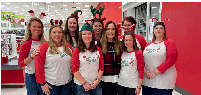
Because of the Beth Haynes 12 Days of Christmas Auction, the McNabb Center can host "Elf Shopping" where employees and volunteers shop for Christmas gifts for nearly 250 children served by the Center.

The Dear Santa provides holiday gifts to children in need served by the Center and their siblings. Donors fulfilled Christmas wish lists for more than 1,000 East Tennessee children.