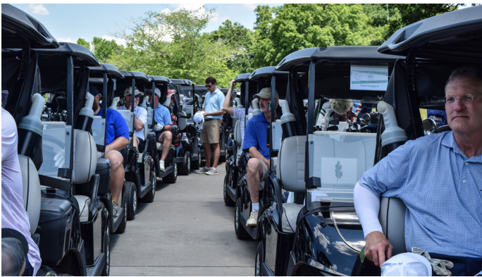
Teams lined up for 1 p.m. shotgun start