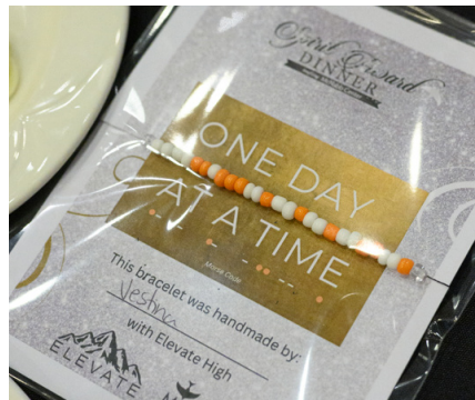
Bracelets made by Elevate High School students