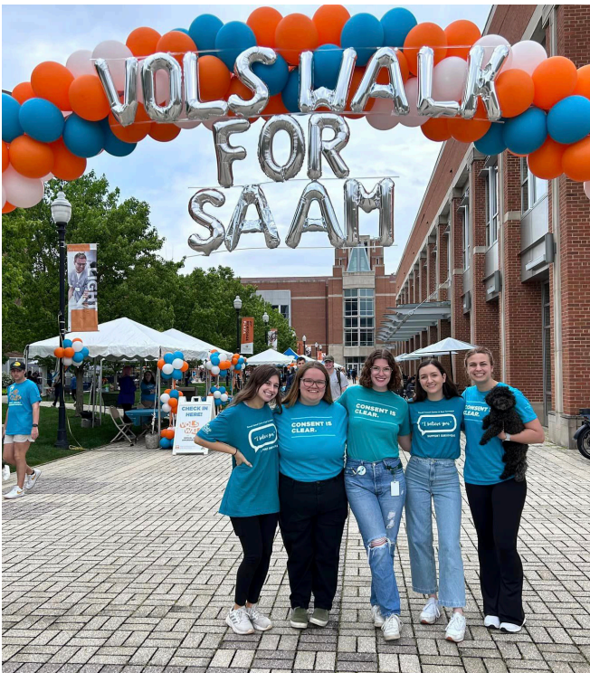
Sexual Assault Center of East Tennessee staff attended University of Tennessee, Knoxville's Vol Walk for SAAM, Sexual Assault Awareness Month