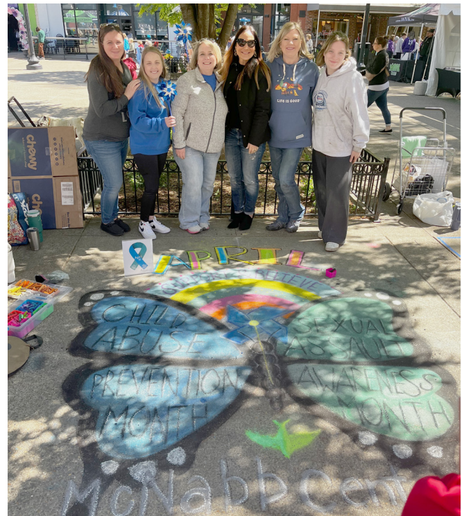
Staff participated in the Dogwood Arts Chalk Walk to bring awareness to Child Abuse Prevention and Sexual Assault Awareness