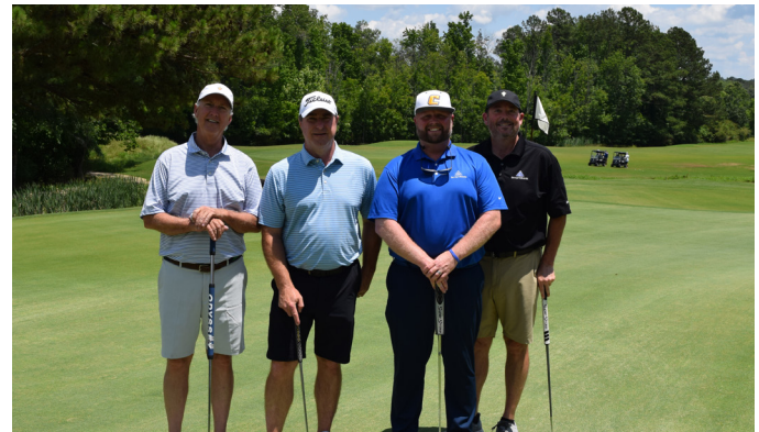
Players from SmartBank