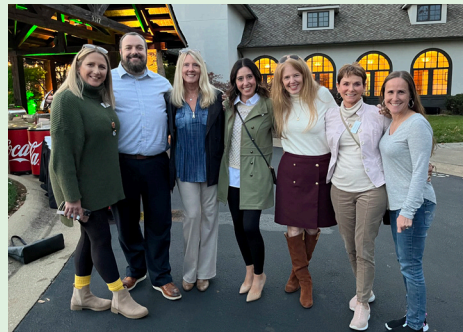
McNabb Center Executive Staff