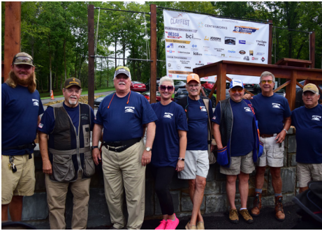
Mountain Shadow Farm