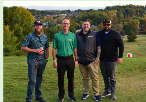
Hiller Plumbing, Heating, Cooling & Electrical