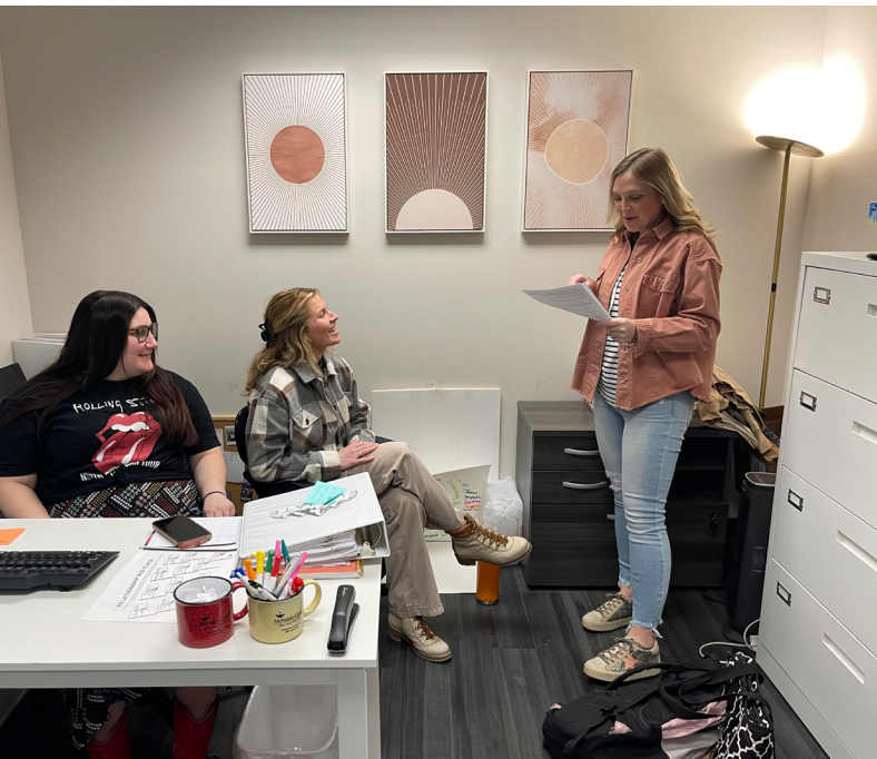
In fiscal year 2023, McNabb Center staff supervised over 110 interns from a variety of programs including nursing, social work, counseling and family studies.